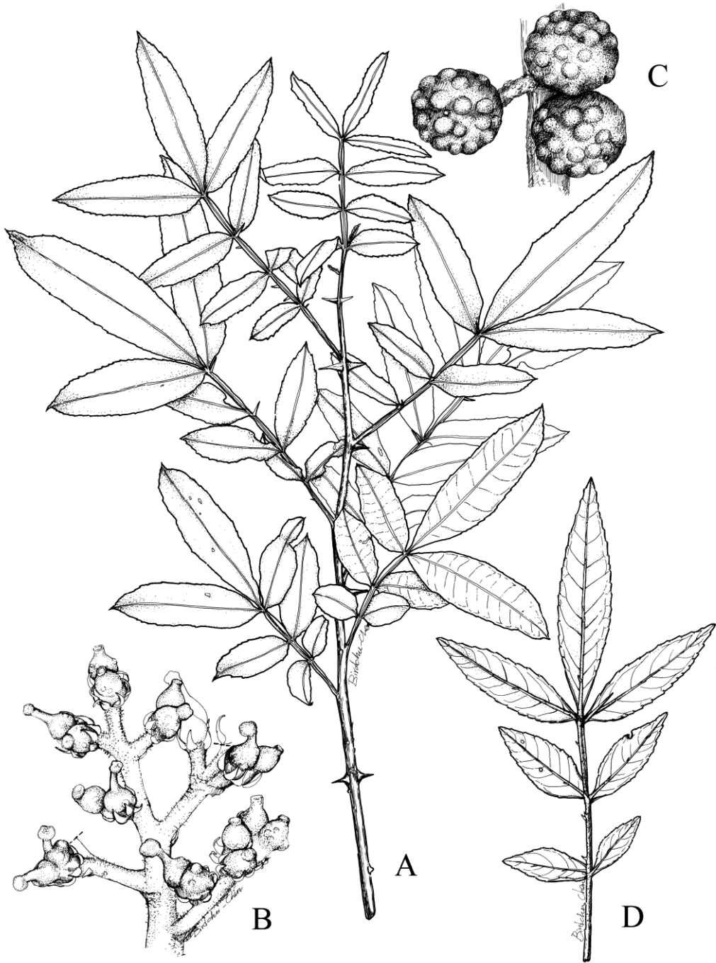
Fig. 2. Zanthoxylum acanthopodium DC. A: habit; B: female inflorescences; C: fruits; D: secondary veins of leaflet.