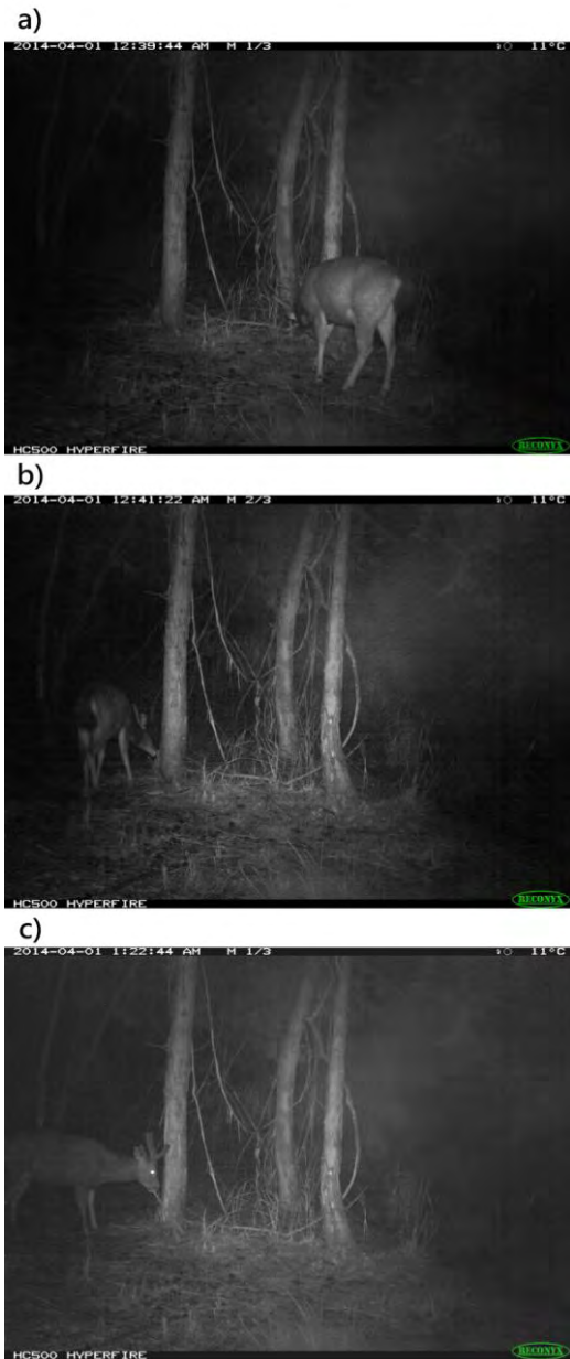
Fig. 2. Behavior of an adult male Formosan sambar in a Taiwan red cypress plantation on Nanshi forest road caught on camera during the early hours of April 1, 2014. a) Sniffing at the base of a Taiwan red cypress. b) Stripping off bark from a Taiwan red cypress. c) Holding a strip of bark in its mouth.