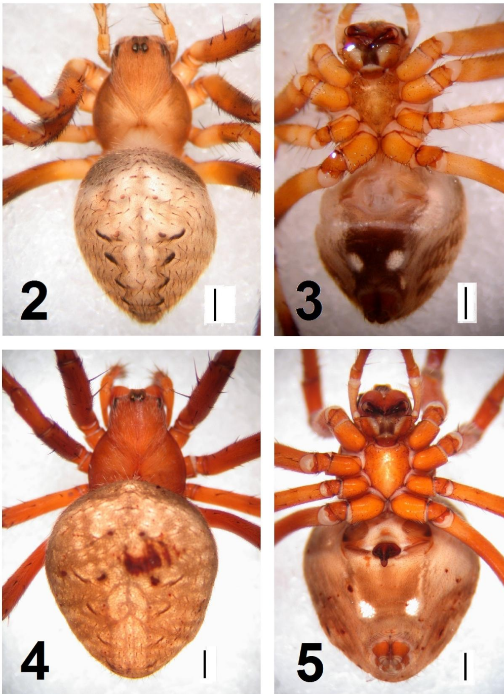
Figs. 2–5. Habitus of Neoscona multiplicans (Chamberlin, 1924). 2–3, female from Chihnankung (NTNUB-Ar 48813), epigynum was removed; 4–5, female from Pinglin (NTNUB-Ar 1525). 2, 4, dorsal view; 3, 5, ventral view. Scales = 1 mm.